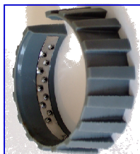
Steel-Galvanized Grip Ring